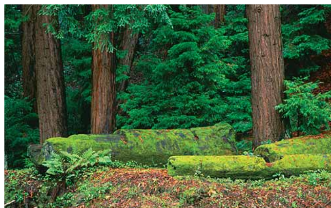
Pfeiffer Big Sur State Park