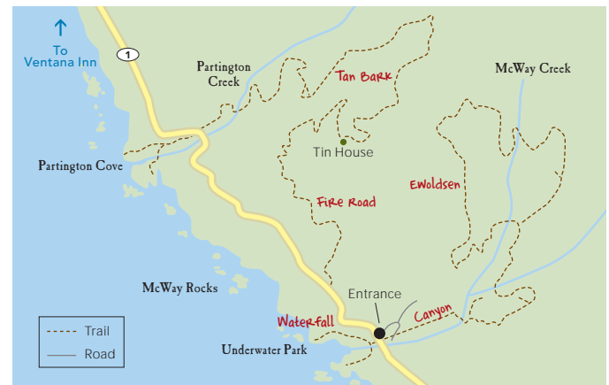
Limekiln State Park