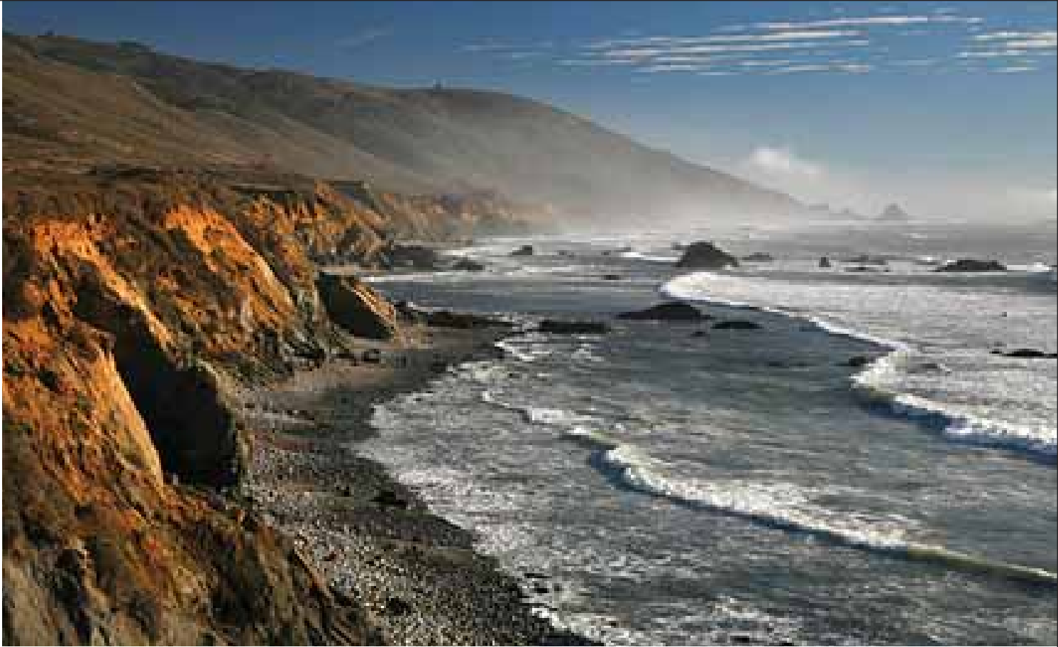
Andrew Molera State Park